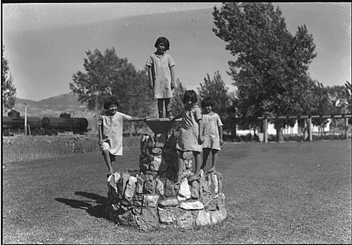
Stewart Indian School is now a historical site but was in operation as a Native American boarding school from 1890 to 1980. Carson, NV